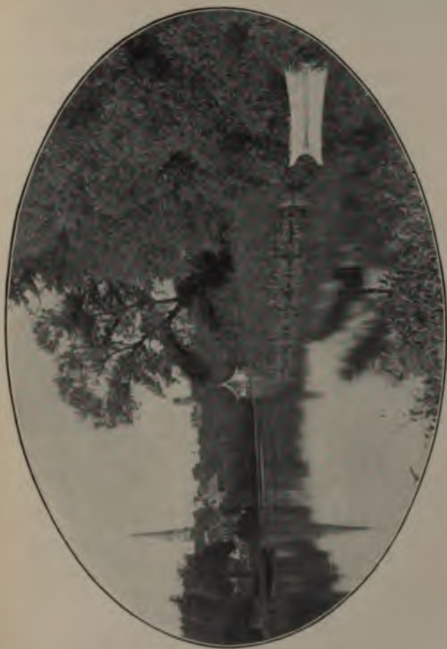
ARLINGTON LAKE (SPY FOND)